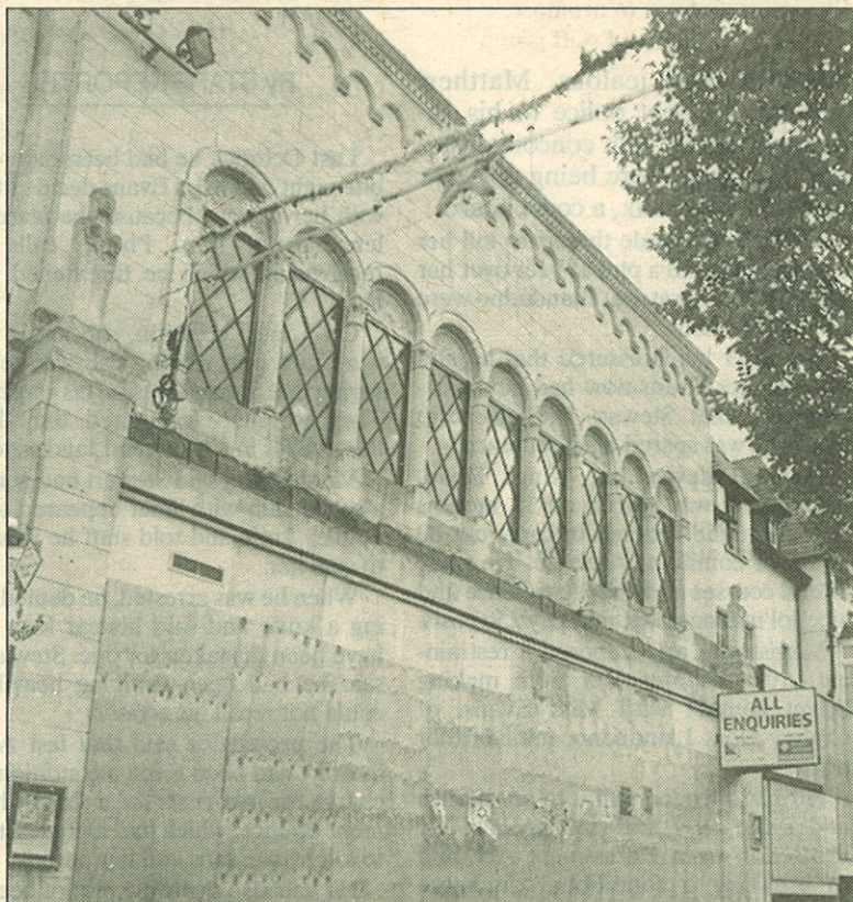
Good news: The empty Co-op Living store is to be taken over by the Cardiff-based clothes chain, Peacocks.

The company, who reported a 28 per cent increase in profits for 1999, was established in Warrington in the late 19th century.